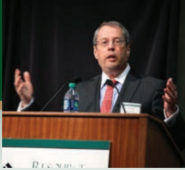
Commissioner David Porter of the Texas Railroad Commission said hydraulic fracturing is key to new oil production.