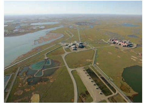
Oil production has and continues to account for nearly 90 percent of state revenues.

Interestingly the average estimated tax rate under the new SB 21 tax is higher, at 35 percent, than the 34.9 percent average tax rate estimated if ACES were to remain in effect for the year, according to the estimate. The same thing would happen next year, Fiscal Year 2015, beginning July 1. For that year, the SB 21 tax rate will be 35 percent while the estimated tax rate for ACES would be 32.6 percent. The higher effective rate under SB 21 is mainly because the new tax has a flat rate of 35 percent while the ACES base tax rate is 25 percent, but is adjusted by the progressivity formula. If oil prices are high the effective tax rate is higher. If prices