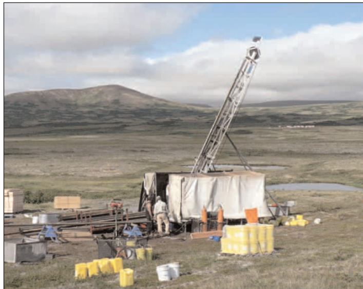
A crew monitors drilling at the Pebble project site in the South Fork Kaktuli Valley. The open pit and proposed tailings lake would be located in the small treeless valley which is surrounded by rolling hills.

wetlands, fish habitat and wildlife populations. The 2005 spending is on top of more than $30 million the company invested in the project in previous years.