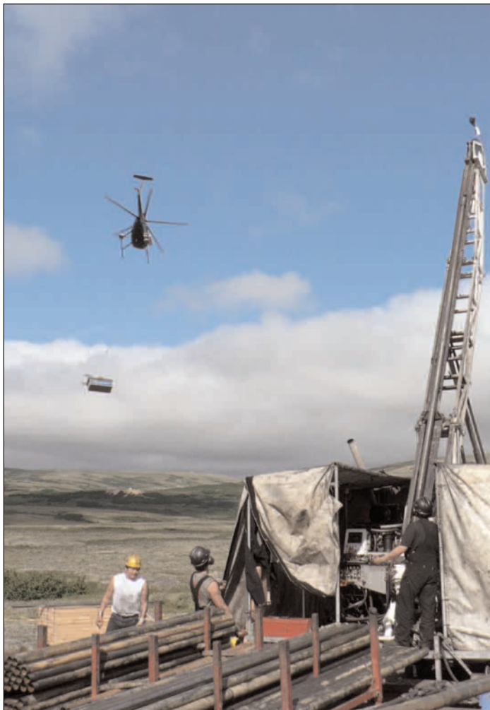
Helicopters are used to haul equipment and workers to the site of the Pebble prospect, 19 miles northwest of Iliamna.