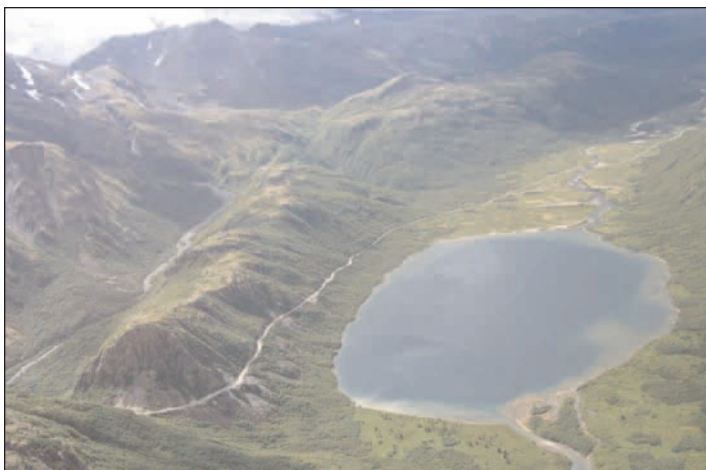
A narrow road from Cook Inlet to Pedro Bay on the north end of Lake Iliamna cuts through a narrow pass. The road would be upgraded and extended to haul equipment and supplies to Pebble, should the project move forward.

While Jenkins and his team of environmental specialists and engineers are eyeing a slurry pipeline to transport the concentrate to a new port at Iniskin Bay on the western side of lower Cook Inlet, an existing road from the coast would still need to be upgraded and extended to the mine site to haul equipment and supplies. NDM had initially planned to haul the concentrate out by truck, but local communities like Pedro Bay expressed concern over