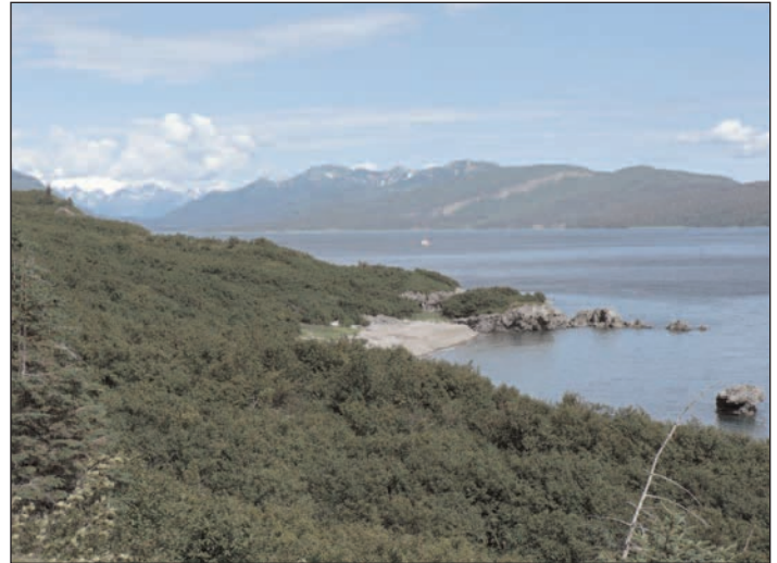
Northern Dynasty is considering locating a deep-water port at Iniskin Bay, on the west side of Lower Cook Inlet. Concentrate from Pebble would be shipped out of the port to smelters overseas.

Some residents have voiced concern about the tailings dam failing in a natural disaster or water seeping into streams beyond the facility. Jenkins said the 750-foot high, moderately-sloping gravel embankment or barrier would have a very wide base and would not be subject to