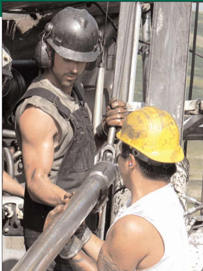
Since 2002, NDM drilled 366,279 feet of rock core in 391 holes at its Pebble properties. The drill program is important because the results will further define the details of the geology, which is an integral part of the mine-planning effort.

“But even among those who may favor mineral development, more important than money is how mining