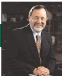
CONGRESSMAN DON YOUNG