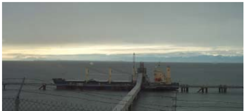
A ship docks at Agrium's nitrogen facility dock in Nikiski. RDC visited the facility, as well as the BP GTL plant now under construction.