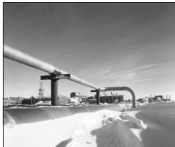
North Slope oil fields account for approximately one-fifth to one-sixth of America's domestic oil production. Following the pipeline's shutdown last month, crews scrambled across the North Slope to reduce oil flow to about 5 percent of the daily 1 million barrels per day.

"This event gave me the opportunity to see first hand the teamwork, dedication and experience required to accomplish a cold start up of these production facilities," notes Ruth Germany, Greater Prudhoe Bay Operations Manager who shares the position with Fritts. "It was no small feat to work equipment problems, process