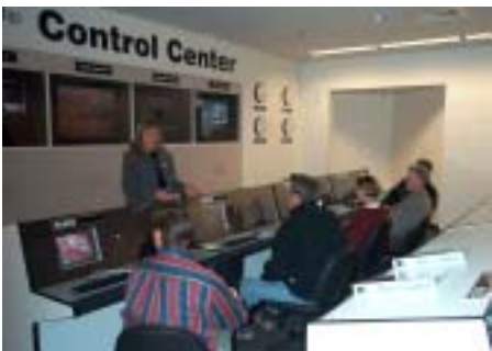
The Challenger Learning Center in Kenai was one of the most fascinating and popular stops on the trip.