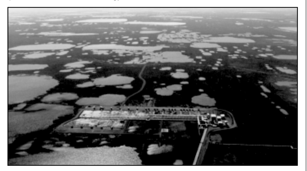
New technology has dramatically reduced industry's footprint on the North Slope.

"We can do the same in the Coastal Plain of ANWR by shutting down exploration during the 6-8 weeks when