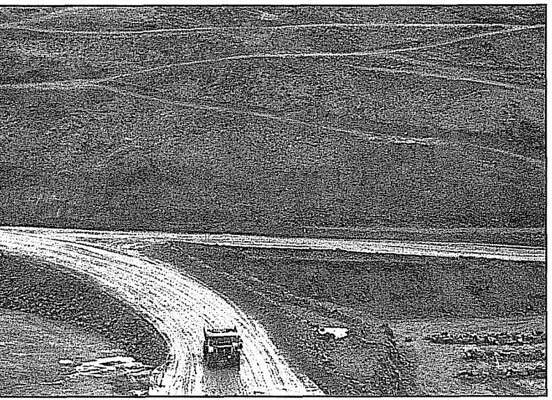
Cominco's Red Dog Mine, the world's largest zinc concentrate producer, will be one of several projects showcased at the Kotzebue summit. The mine is located on NANA land.

"Unlike any other state, there are great economic interdependencies between urban and rural Alaska, which makes this summit especially important