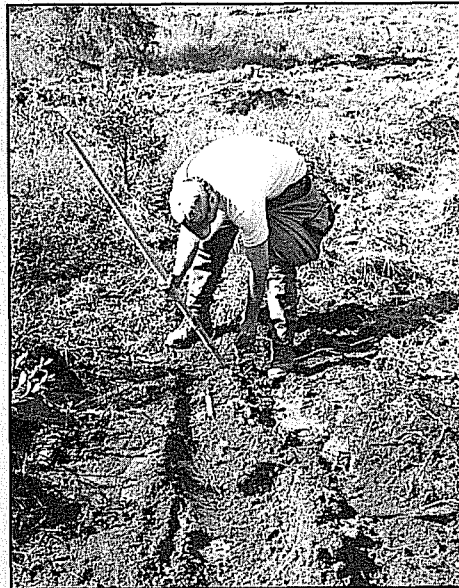
A quality control crewman follows the mechanical-planting process to make sure seedlings are properly planted and to add extra ones where needed.

"Our mission statement includes being a responsible resource development company and intrinsic to that statement is our desire to replant areas that we selectively logged," said Nininger. "By the close of 1997, Circle DE will have planted almost a million