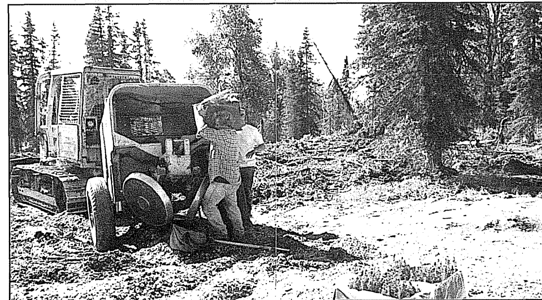
The reforestation crew loads seedlings into a V-plow which is used in the mechanical planting process.

Last summer CDEP planted some 300,000 seedlings on University of Alaska land at a cost of $115 an acre. The 750-acre tract was once covered with beetle-ravaged timber. This summer the company began planting in May, hoping to get up to 400,000 seed-