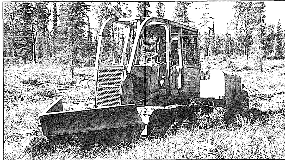
A Circle DE Pacific Corporation contractor plants seedlings on logged lands south of Clam Gulch.

After the trees are cut, sold or chipped, the forest floor is prepared for regrowth by scarifying the soil to expose mineral-rich soil, thereby encouraging natural regeneration. The company then moves to the next step by