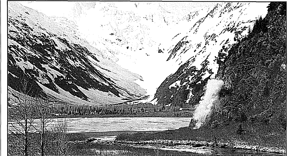
With Portage Lake in the background, the ceremonial blast for the Whittier road took place in Bear Valley in early May.