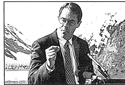
Governor Knowles addresses 100 invited guests at the May 6 ceremonial blast in beautiful Bear Valley.

total elimination of the chemical "dihydrogen monoxide." And for plenty of good reasons. It can cause excessive sweating and vomiting, it is a major component in acid rain and it can cause severe burns in its gaseous state. Accidental inhalation of the chemical can kill and it contributes to erosion. It also decreases effectiveness of automobile brakes and it has been