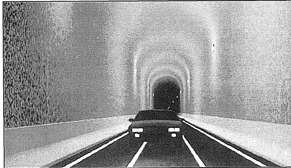
A computer simulation depicts an upgraded one-lane Alaska Railroad tunnel to Whittier. Both private vehicles and Alaska Railroad trains would share the 2.5-mile tunnel.

The recent Trustees for Alaska lawsuit has frustrated tourism officials and the industry's top associations which have long considered road access to Whittier and Prince William Sound vital to the needs of a growing tourism industry. Both the Alaska Visitors Association (AVA), the statewide trade association representing the visitor industry in Alaska, and the Anchorage Convention and Visitors Bureau (ACVB)