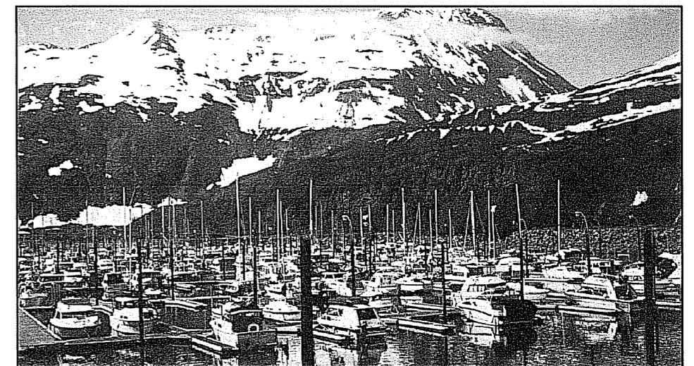
The proposed $50 million Whittier road project would provide direct access for the general public to Prince William Sound, enhance tourism, recreational opportunities and strengthen the local economy. Pictured above is the Whittier small boat harbor.