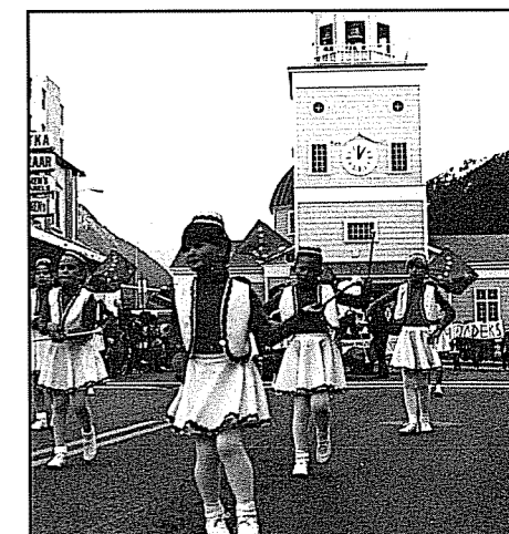
The Alaska Day parade in Sitka draws large crowds to the old Russian capital of Alaska.