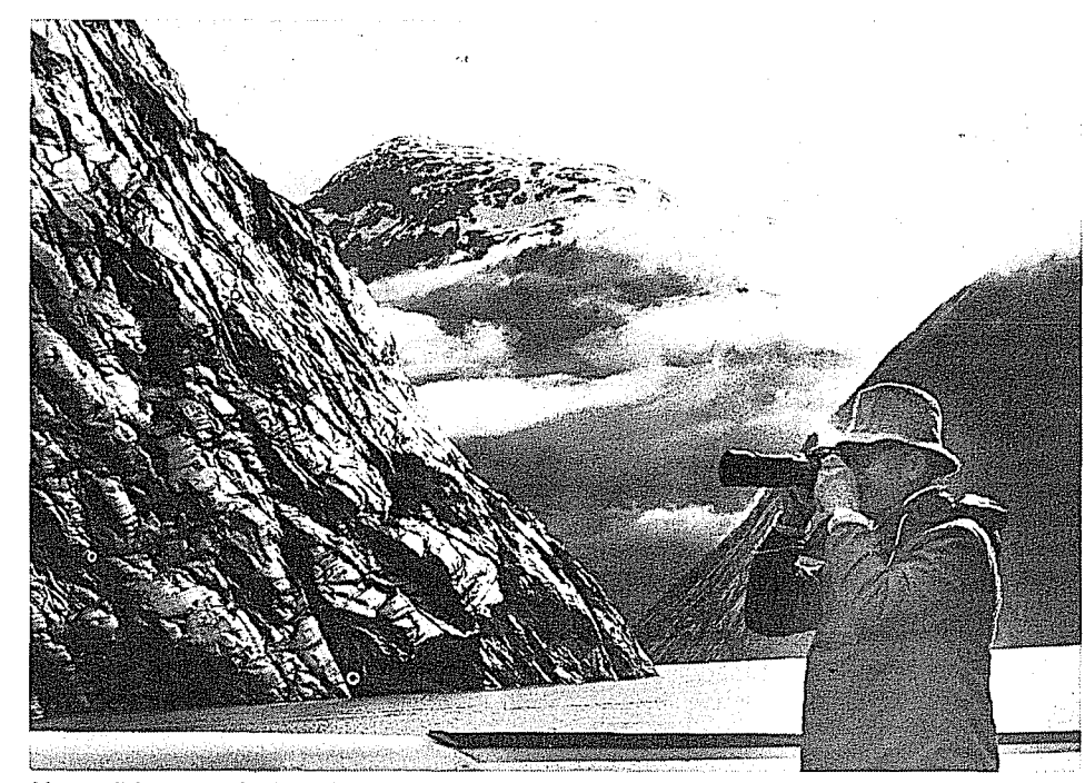
New wilderness designations could lock out a majority of the public and close the door on many new diverse commercial visitor opportunities.