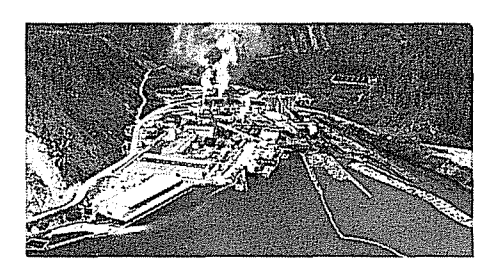
The Tongass timber harvest accounts for over 9,000 direct and indirect year-round

The House bill would also force the renegotiation of two 50-year contracts for timber supply to Southeast Alaska's two major pulp mills.