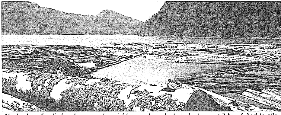
Alaska has the timber to support a viable wood products industry, yet it has failed to allo cate sufficient land for commercial harvests.

RDC pointed out that Alaska could have more than 25,000 people employed in the forest products industry if it develops its forest products industry to the extent that Ontario has under the Forest Management Agreements.