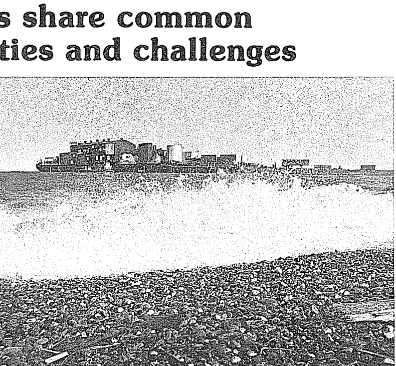
1986 will bring the biggest summer sealift ever and the largest construction year yet to the North Slope. Oil companies say such activity is the result of a stable tax climate, adopted by

The Resource Development Council is forming a task force to work on issues surrounding potential oil and gas development in the Arctic National Wildlife Refuge (ANWR). The first meeting of the task force will be held February 18 at 4:00 p.m. in the RDC conference room at 807 G Street, Suite 200. U.S. Fish and Wildlife Service officials will be