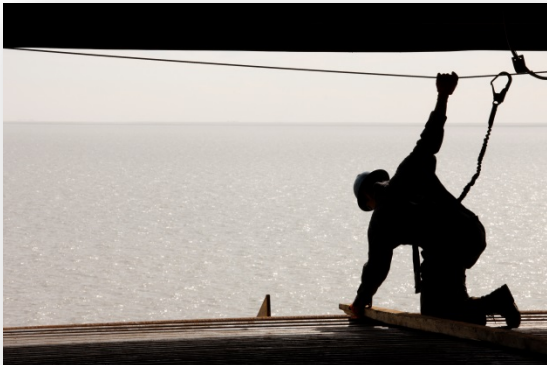
Health and Safety